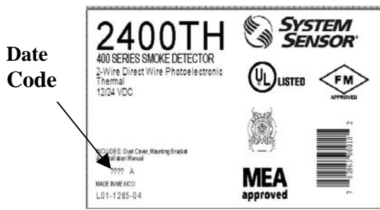
Typical Product Carton Label