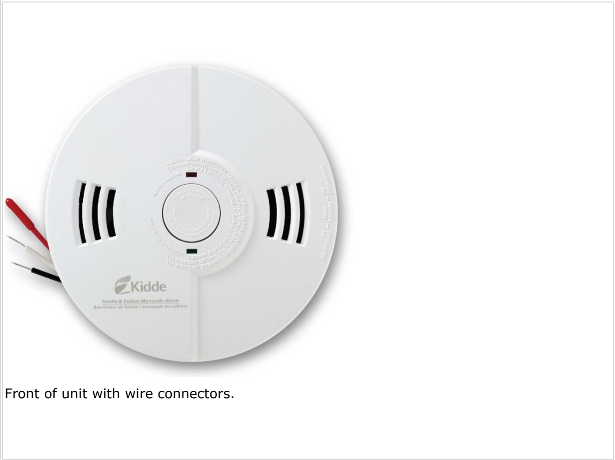
Front of unit with wire connectors.